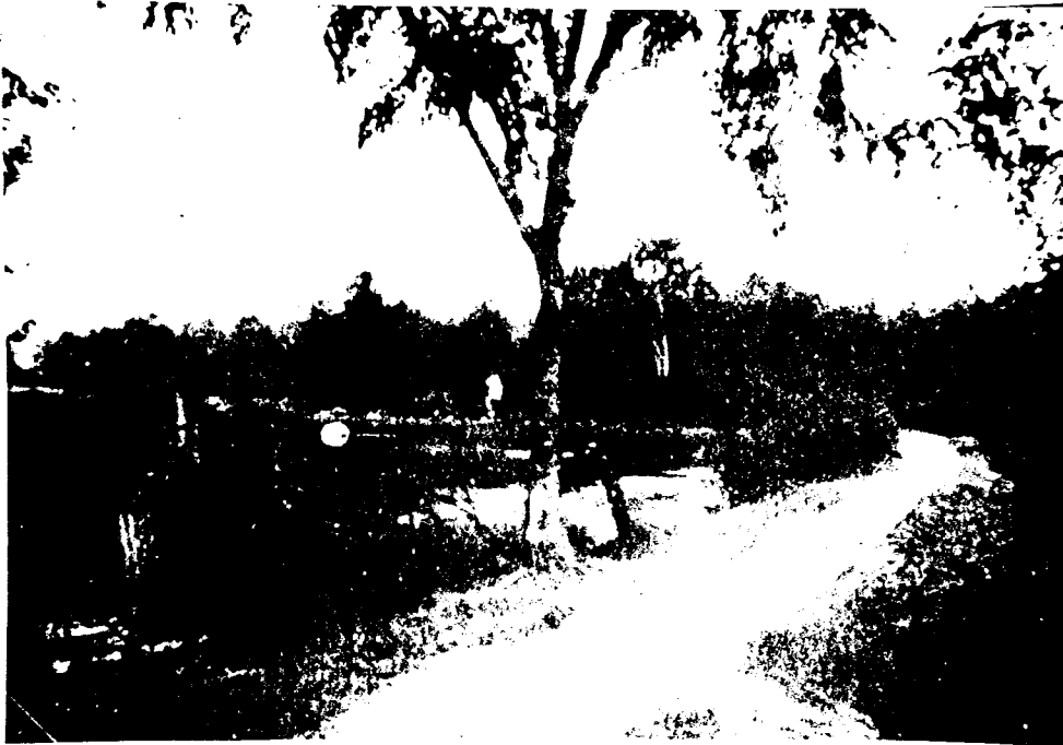
The Drinkwater boathouse on the beach in front of cottage #1, Lot 23, Con. II, Limerick Twp. looking toward the culverts, early 1920's.